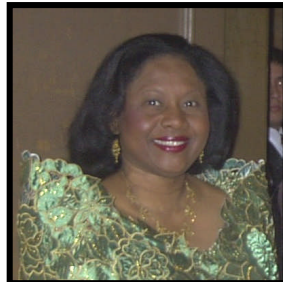
Suzette Benn Special Appreciation Award